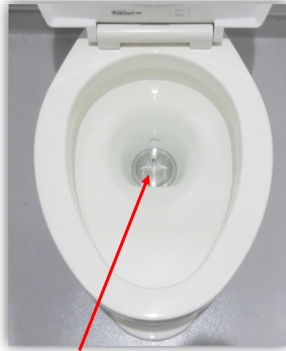
< TF Cap >

Made immediately available for use, only by removing TF cap on the bottom of the toilet with a metal fitting, in the event of a disaster