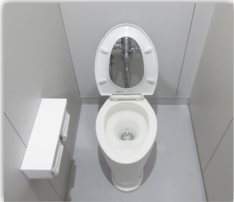
Usually, used as a flush toilet

“arsona \alpha ” can be used comfortably and hygienically even indoors as compatible with odors.